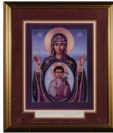
1997-98 Our Lady of the New Advent