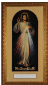
2003-04 Divine Mercy