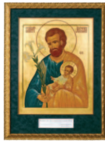
2021-23 St. Joseph