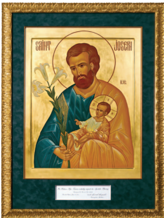
In Honor of the Supreme Knight of the Order of the Knights of Columbus St. Joseph, Patron of the Holy Family and of the Holy Church 1917-1918

Bearing those words in mind, I chose to entrust my service as Supreme Knight to St. Joseph, and through this Pilgrim Icon Program, we can all turn in prayer to St. Joseph. We give thanks to God for the gift of his fatherly example, and we ask St. Joseph to be a father to us. Along the way, may we also grow in our own imitation of St. Joseph's quiet strength, integrity and fidelity.