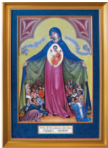
2018-20 Our Lady Help of Persecuted Christians