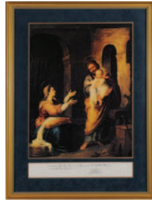
1993-94 Holy Family