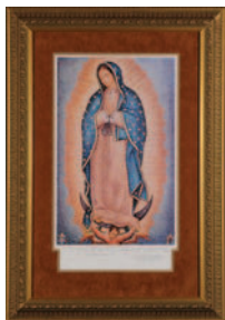
2000-01 Our Lady of Guadalupe