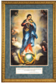
2013-14 Immaculate Conception