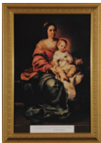
2002-03 Our Lady of the Rosary