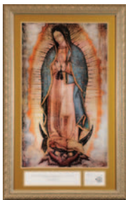
2011-13 Our Lady of Guadalupe