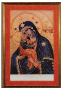
1988-89 Our Lady of Pochaiv