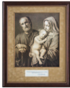
2015-17 Holy Family