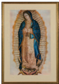
1979-80 Our Lady of Guadalupe