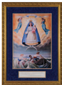
2007-08 Our Lady of Charity