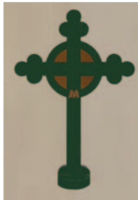
1999-2000 Millennium Cross