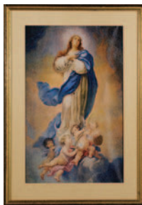
1981-82 Immaculate Conception