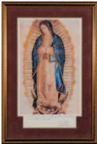
1995-96 Our Lady of Guadalupe