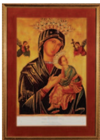
1984-85 Our Lady of Perpetual Help