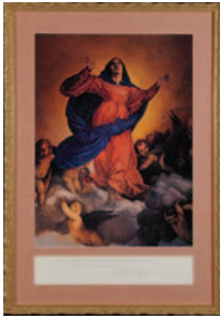
1990-91 Our Lady of the Assumption